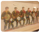
Rosapenna Hotel Downings Downings, Downings, Co Donegal, IE