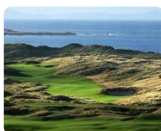
Royal Portrush Golf Club – Golf Portrush